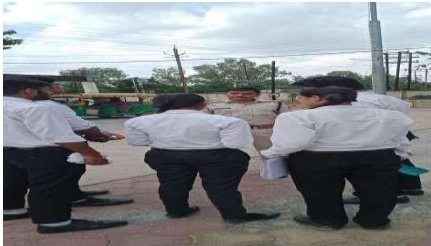
Glimpses of students in police station during their 21 days internship.